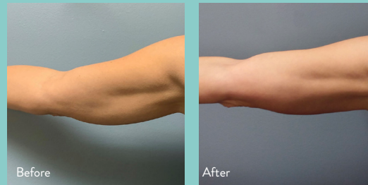
Dr. D. Kiba

For patients wanting to turn back the hands of time without any further disruptions to their daily activities, Evolve's treatments are ideal - there is no surgery, no anesthesia, no scars, and no downtime. You can return to your regular routine immediately after these total body procedures.